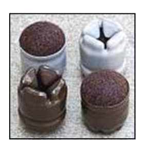
SLIP ON FELT FEET

These slip-on felt feet are available in two sizes. They slip over round or square legs with or without feet already installed in the legs. Useful for both noise reduction and floor protection.